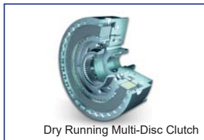
Dry Running Multi-Disc Clutch