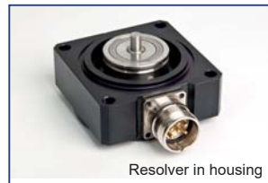
Resolver in housing